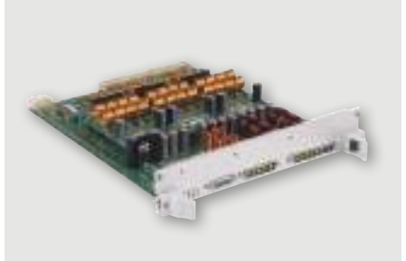
670W coreless technology DC/DC power supply, fully DSP-regulated converter for use in strong magnetic fields such as in MRI systems. 2.4 MHz switching frequency.