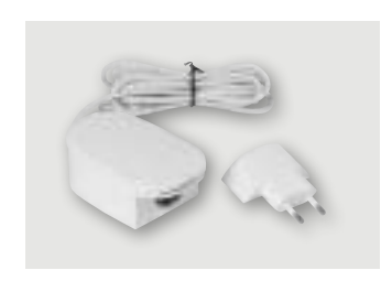
Medline 30 EXM30 Series 30W adaptor Universal input 90-264VAC Ultra low leakage <10μA Single output 12.2, 15.2 or 24.4VDC