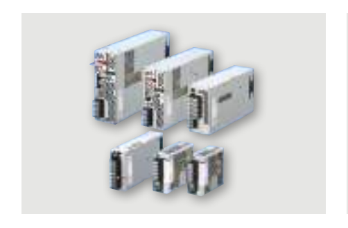
Enclosed 10W - 10KW

highest quality and most reliable products seen anywhere in the world today. The Cosel Group is a global company with sales offices throughout Japan, Asia, Europe and North America.