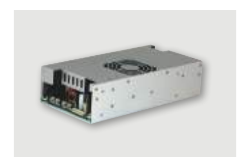
650W AC/DC enclosed single output power supply customized for peak power, low noise and improved heat management powering surgical displays.