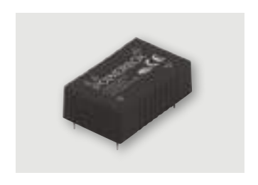
Medline 03 PMP/PMM03 Series 3.3W DC/DC converter 2:1 or 4:1 input voltage range Single output Galvanically isolated versions up to 6 kVDC