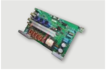
2250W AC/DC capacitor charger for laser applications, certified to comply with the medical safety standards.