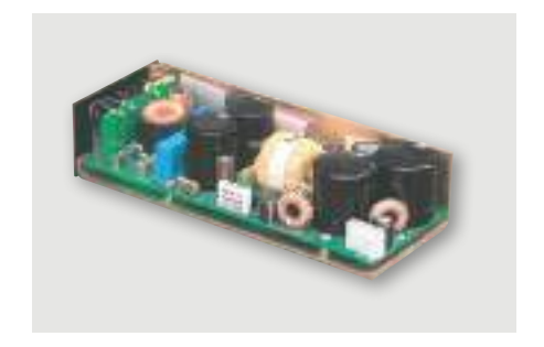
200W AC/DC open frame customized to deliver 385W output power supply for ultra welding of medical consumables.

Here are examples of customized products we have provided to medical customers in the past. Powerbox has to date completed more than 2500 custom design projects.