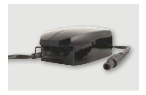
80W AC/DC external adaptor customized to deliver up to 180W for respiratory/ventilation application.