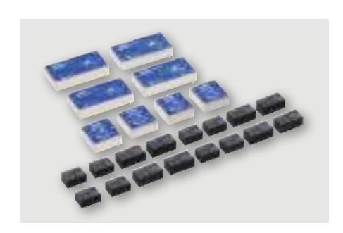
Low power series 1.5W – 80W