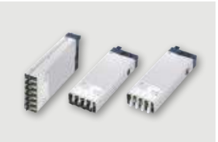
Configurable 300W – 1200W