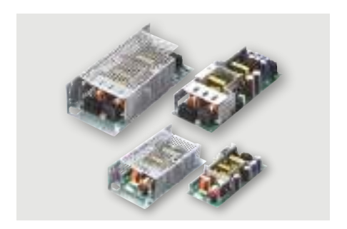
Open Frame 10W - 300W