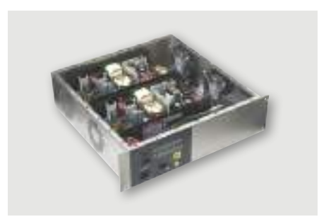
400W AC/DC open frame quad output power supply for diagnostic system.