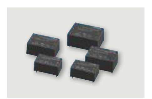
PCB 3W - 25W