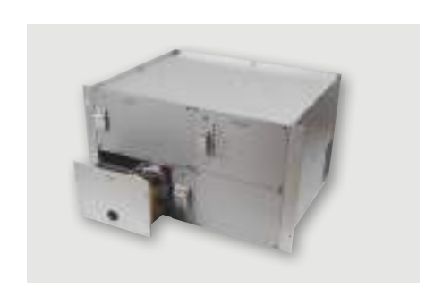
1000W DC UPS system built to ensure patient safety during critical applications.