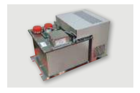
Power system designed for Mobile Medical Electrical Equipment (MEE) applications and for use within professional healthcare environments.