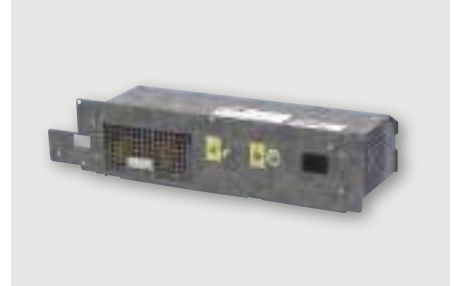
900W AC/DC enclosed multi output power supply for printing of diagnostic images.