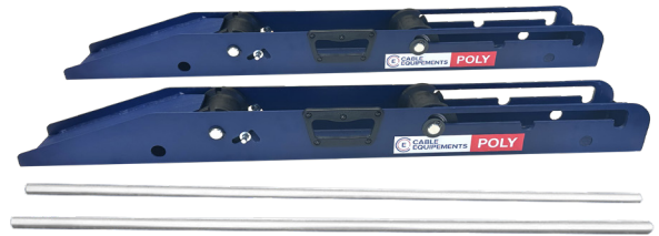
Can be dismantled into 4 elements

✓ Dismountable, carrying handle: easy to carry