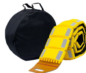
Roll-up speed bump + bag