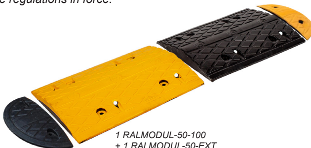
1 RALMODUL-50-100 + 1 RALMODUL-50-EXT