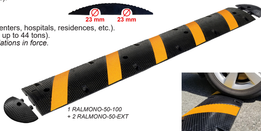
1 RALMONO-50-100 + 2 RALMONO-50-EXT