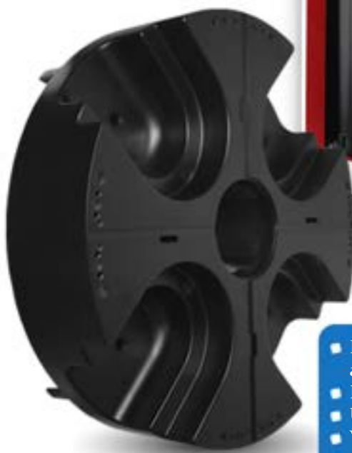
Machined and painted part